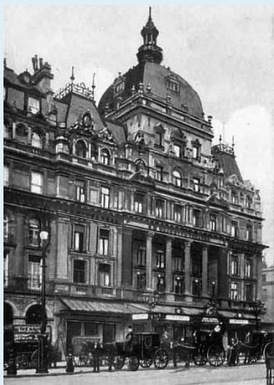
Her Majesty's Theatre, London

Sir Herbert Beerbohm Tree was one of the greatest actor-managers of his day. He mounted spectacularly elaborate productions of Shakespearean drama,